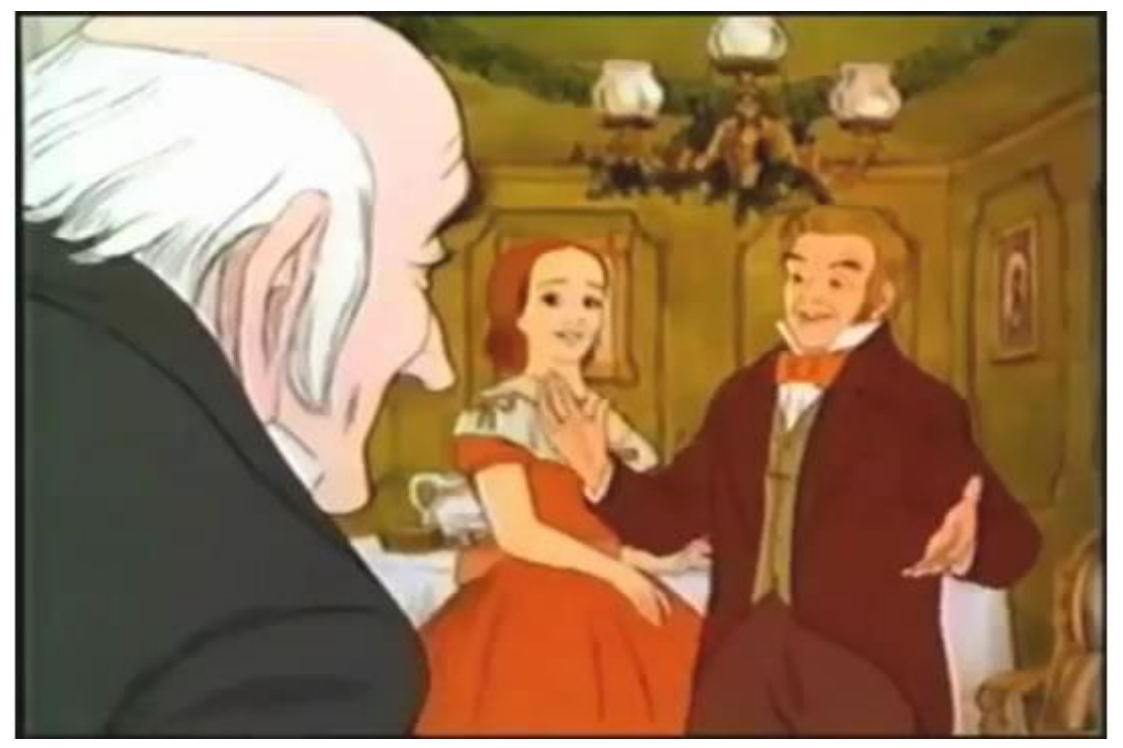
He then went to his nephew's house for a wonderful Christmas day.